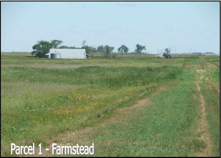
Parcel 1 - Farmstead